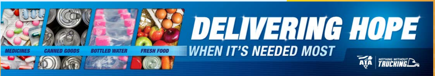
▼ TRAILER WRAP DESIGN ▲